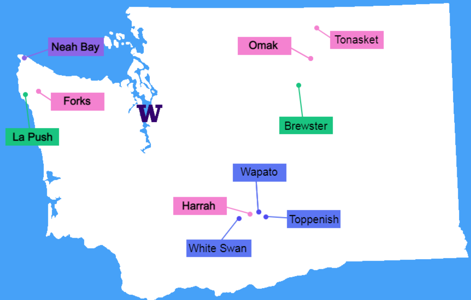
Map of 2021 ASB sites. EASB sites are in green; STEM/CASE ASB sites are in blue. Literacy Arts ASB sites are in pink, and Neah Bay is the site of the Telling Our Stories, Imagining Our Futures program

This Spring, 517 k-12 students and 44 UW students participated in our ASB programs.